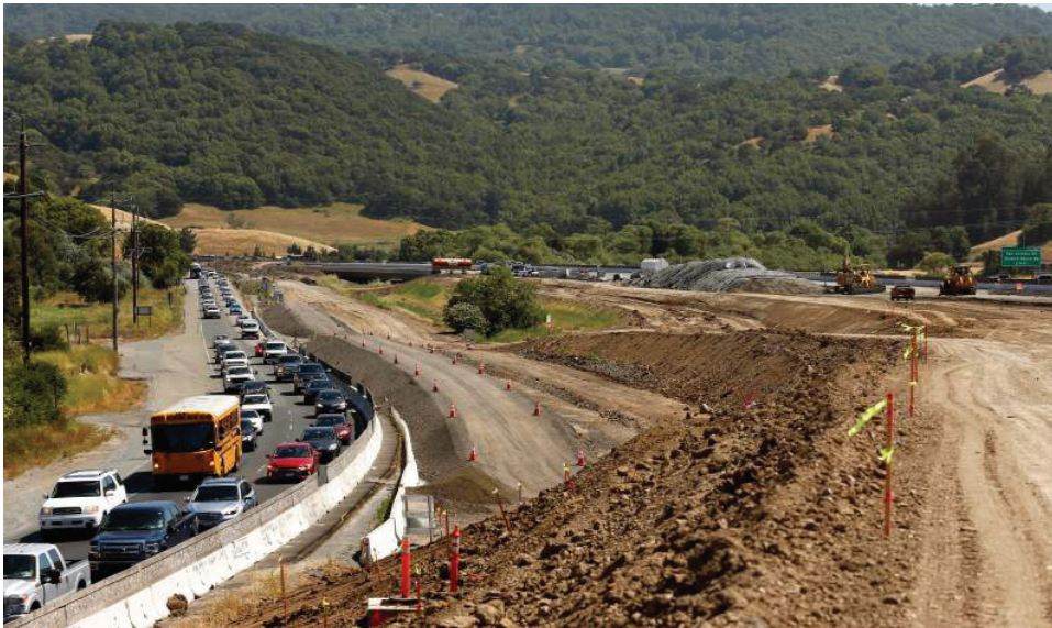
Motorists drive southbound on Highway 101 as wheel tractor-scrapers, at right, grade the soil in the highway median, south of Petaluma, California, on Wednesday, May 30, 2018.