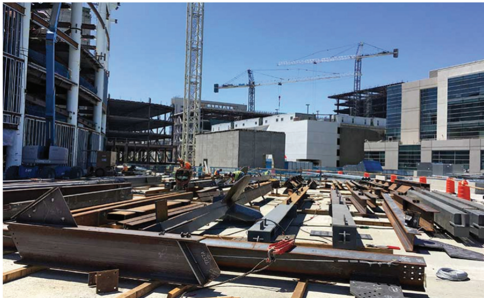
The project's "boneyard" of steel beams outside the arena. The project's tower cranes must be placed not to interfere with the flight paths of nearby hospital helicopters.

Working so close to the water, the project team chose to encase the site in a "bathtub" rather than install a dewatering system, DeLong says, which could risk dewatering areas outside the property line. Crews poured a concrete working